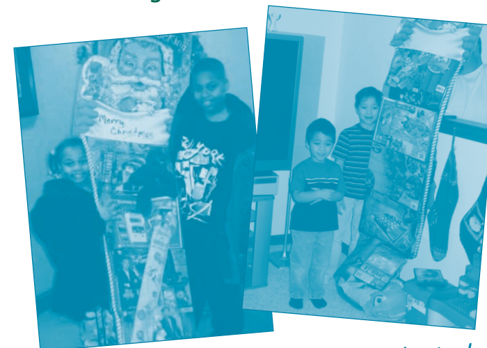
Here are some of the many talented artists who entered our contest!

Keep reading your Credit Union newsletters to learn about upcoming contests and ways for you to stay involved with the Credit Union throughout 2008.