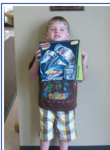
Danny Air Hog Remote Control Helicopter