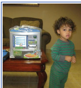
Cody ATM Machine Bank

Upper Cumberland FCU held promotions during April to encourage young members to save money. Every young member was automatically entered into the special drawings. The young members could increase their chances of winning by making additional deposits to their savings account during the promotion. The following are some of the winners during this special promotion: