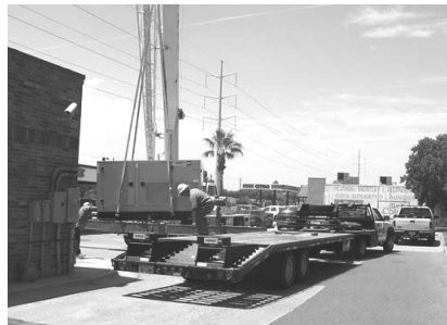
Workers unload new generator for our Gollihar Rd. office.

As part of our ongoing Disaster Recovery Plan, we have just completed the installation of a Caterpillar 60kw generator at our Gollihar office. This back up source of power will assist our office during any future electrical outages.