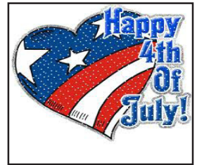
Independence Day - July 4th

UPMC PRESBY OFFICE: Located in the hospital on the eleventh floor by the cafeteria. This location is open 7:30 AM to 3:30 PM Monday and Wednesday and 7:30 AM to 3:00 PM on Friday. This office is closed for lunch from 11:30 AM to 12:00 PM. Call us at 412-647-6337.