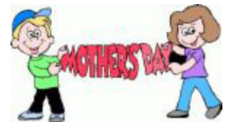
Mother's Day - May 8th

For more information on keeping your personal information safe while using a public network, please log on to the FTC's website at www.ftc.gov .