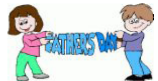
Father's Day - June 19th