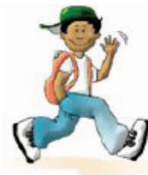
End of Summer = Back to School!

UPMC PRESBY OFFICE: Located in the hospital on the eleventh floor by the cafeteria. This location is open 7:30 AM to 3:30 PM Monday and Wednesday and 7:30 AM to 3:00 PM on Friday. This office is closed for lunch from 11:30 AM to 12:00 PM. Call us at 412-647-6337.