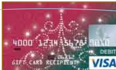
holiday gift solutions