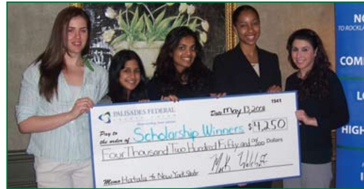
Winners of the 2008 PFCU George Hatala & the NYS Credit Union League scholarships