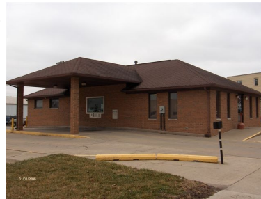
River Community Credit Union 1928-2008 and going strong!

The credit union pays for half your meal and gives away great prizes. That means you only have to