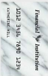
003 GREY & WHITE MARBLE