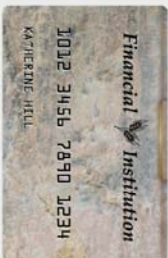
027 FRESCO Y