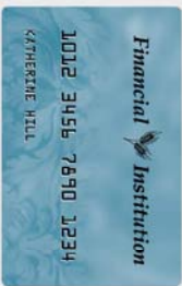
028 FLEUR-DE-LIS † ★ Y