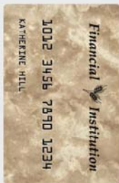
001 BEIGE MARBLE Y