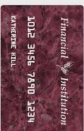
000 EGGPLANT MARBLE