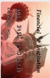
011 STATUE OF LIBERTY