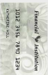
037 PORTICO Y