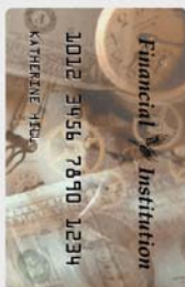
016 MONEY & GEARS