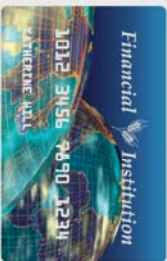
018 EARTH GLOBES