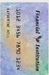
035 AURORA Y