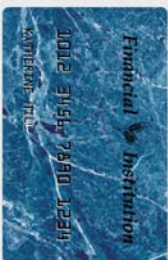
021 BLUE MARBLE Y