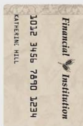
028 CORONET † ★ Y