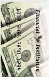
015 $20 BILLS Y