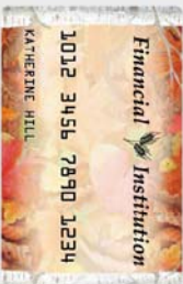
008 GREAT FORESTS