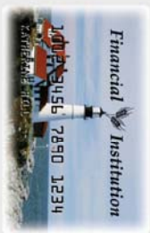
012 LIGHTHOUSE Y