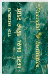
002 GREEN & GOLD MARBLE Y