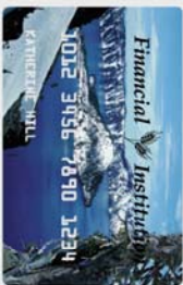
013 MOUNTAINS Y