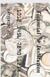
017 COINS & CASH Y